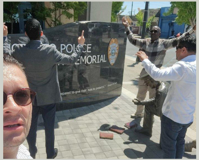
With hands lifted, prayer is made in front of the officer memorial located in front of the Modesto Police Department .