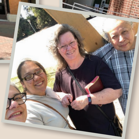
These lovely ladies prayed for the Stanislaus County Office of Education and the Modesto City Schools' district office buildings.