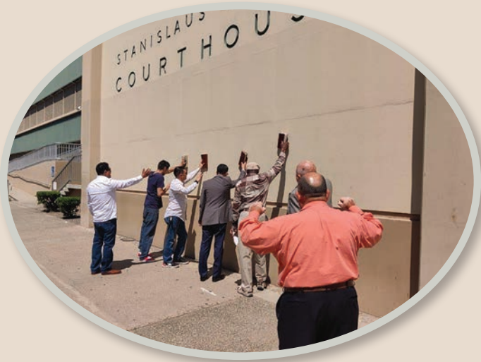
A group of men pray at the Stanislaus County Courthouse . On the other side of the wall is where prisoners wait to enter the courtrooms for their trials.