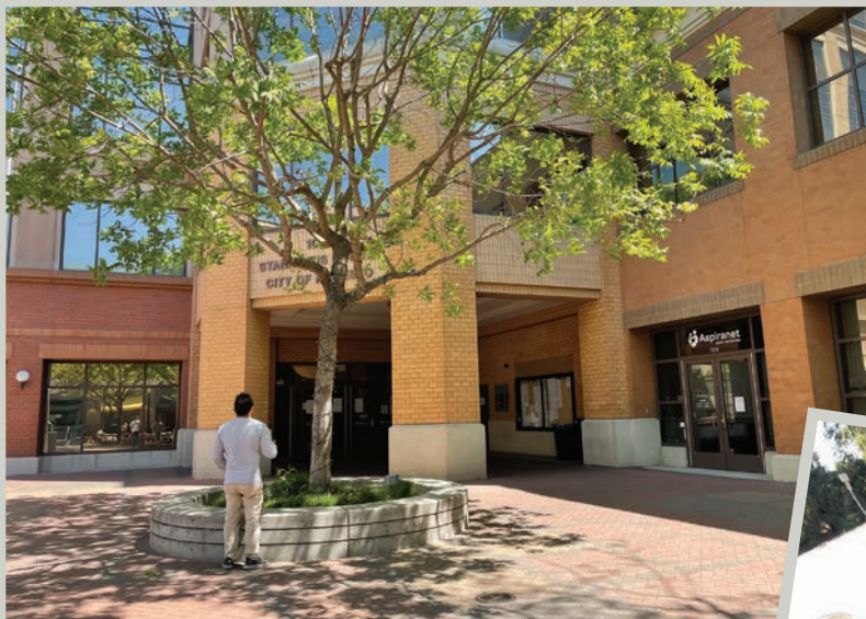
Prayer was also made in front of the county and city offices at 10th Street Place .