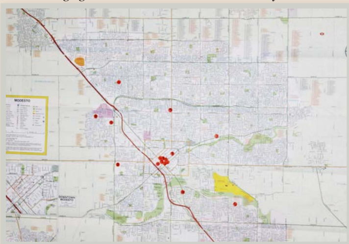
Map of Modesto with targeted prayer walk sites